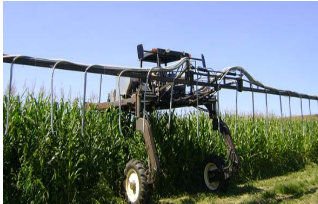
18 Row High-boy Cover Crop seeder will be demonstrated